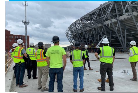
Hard Hat Tour of the new FC Cincinnati stadium