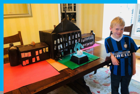
A student modeling with his Dwelling