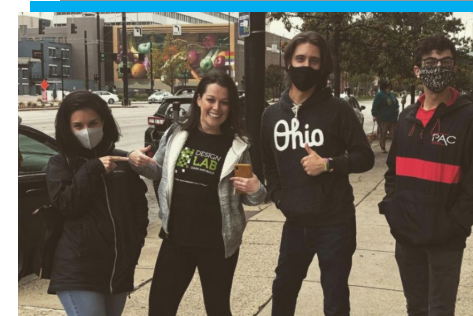
Seek Cincy Team out & about finding clues