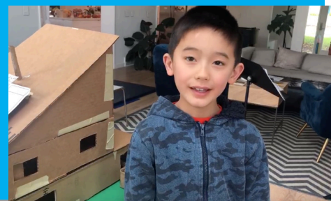
A student posing with his award-winning Dwelling model at his home