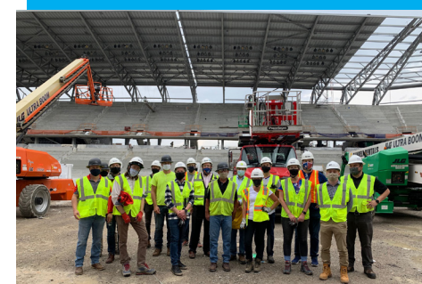
Hard Hat Tour of the new FC Cincinnati stadium