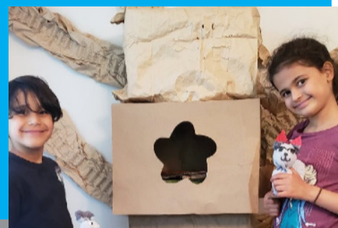
Students showing off the Dwelling they created at home in a video they filmed

We have been so heartening to see how students remain optimistic, innovative, and determined in such uncertain and unstable times. We are so proud of them!