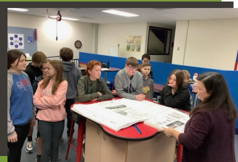
Attendees at the Awards Ceremony