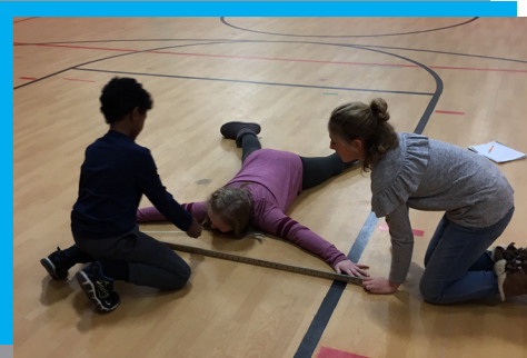
Students learning about spatial awareness