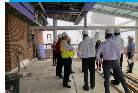
Participants tour the Lytle Park Hotel