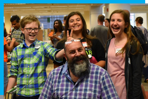
A volunteer celebrating with his students after a great year in Design LAB