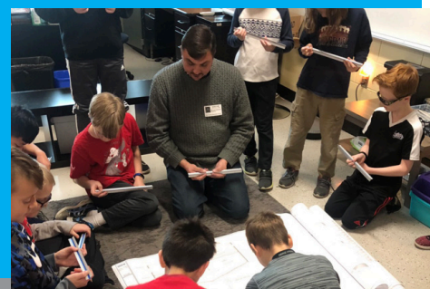
Students learning what an architectural scale is and how they are used

Each year of this program seems to be better than the last, even we are sure we have hit the height of our students' abilities. They never cease to amaze us with their curiosity, creativity, innovative ideas, and passion for the world around them.