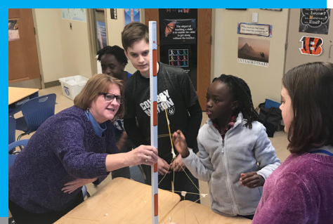
Students measuring their spaghetti skyscrapers