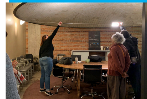
Doors Open attendees admiring Lightbourne's light fixture